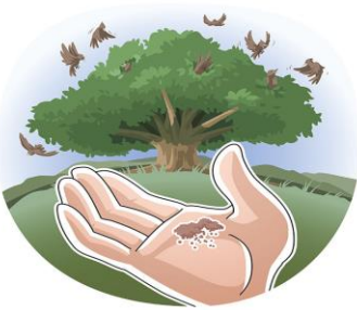
PARABLE OF THE MUSTARD SEED